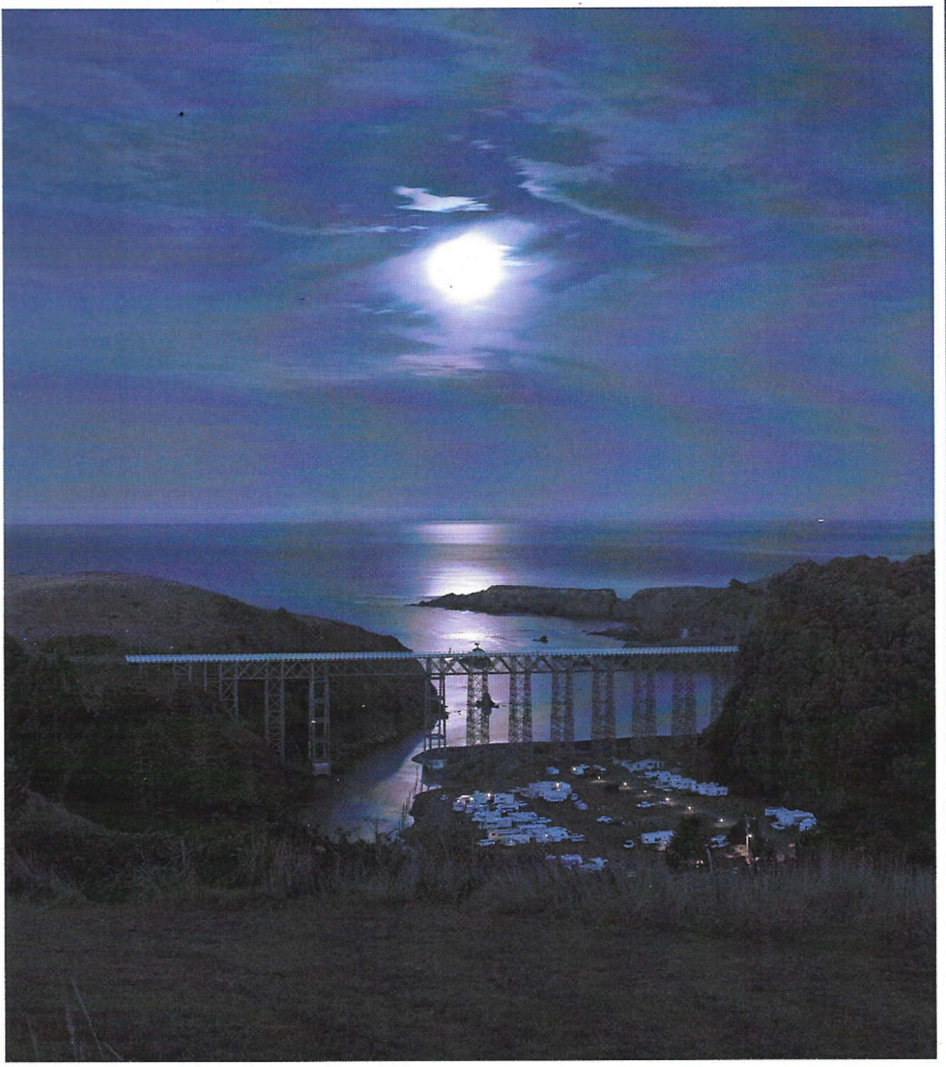
"Moon Setting over Albion Bridge" by Rita Crane © 2011