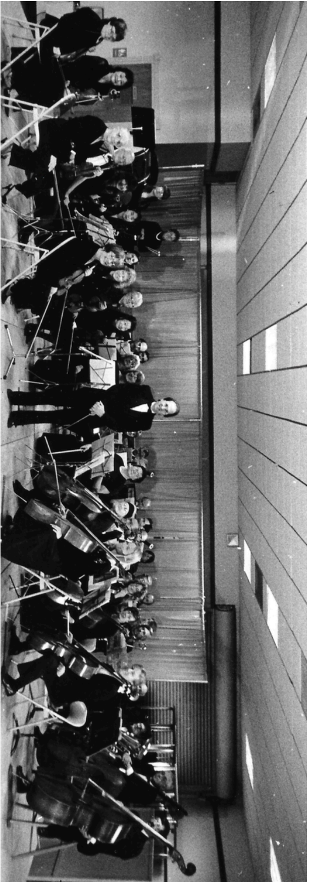
Apple Hall, Boonville Fairgrounds, 1994-97